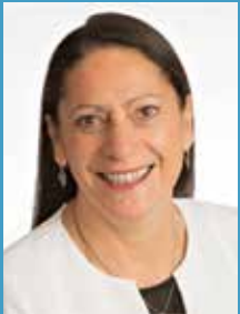
The Honourable Poto Williams Politician