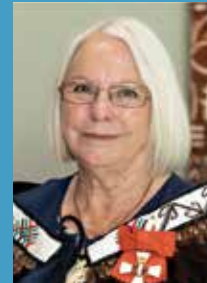
Ros Noonan Chief Human Rights Commissioner