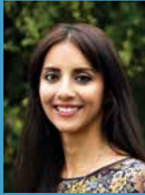
Golriz Ghahraman Politician