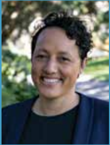
The Honourable Kiri Allan Politician